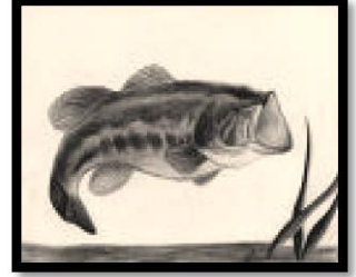
big fish (MP)